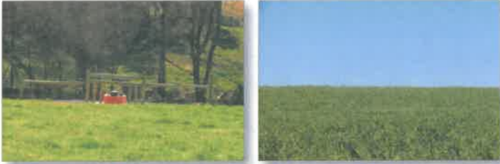
Figure 2. BMPs installed in the Blackwater River watershed include alternative livestock watering systems (left), and small grain cover crops (right).